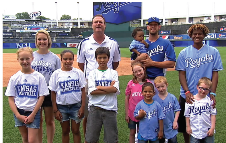
KU basketball Coach Bill Self, KC Royals pitcher James Shields and KVC kids raise awareness about the need for foster families. Check out the PSA at youtube.com/KVCKids .

I am very grateful for the support from our volunteers, corporate partners, and our very talented and committed staff. Knowing that KVC has such a strong base of support, we have initiated our Building Families Capital Campaign to fund the creation of the Institute of Practice Improvement and Innovations in Child and Family Services. Research and learning opportunities for clinicians, therapists, case managers, parents, and foster families all over the country will be significantly expanded with our new, state-of-the-art facility. Campaign funds will further support KVC's nationally recognized efforts in the area of evidence-based practices in the child welfare arena.