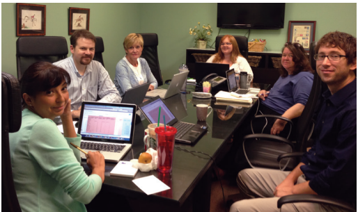
KVC Kentucky staff gather to gain new skills that benefit the children and families they serve.

In addition to the specific trainings offered throughout the year, IMPACT Plus Case Managers have begun weekly training in the Wrap Around Model to continue to increase the effectiveness of this service model to children and families. This training, in conjunction